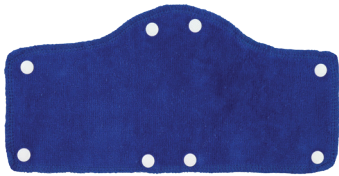
COTTON/TERRY CLOTH SWEATBAND HH-A8