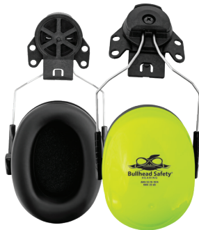
HIGH-VISIBILITY MULTI-POSITION CAP MOUNTED NRR 22 DB EARMUFFS • 3-Point Multi-Position Pivots • Durable ABS Cups • PVC Ear Cushions HP-M3