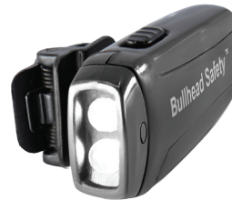
CLIP ON LED LIGHT • Ideal for low light conditions • 360-degree swivel • Bright dual LED light output Six-hour continuous lighting (subject to batteries used) Water-resistant The clip fits items up to 4 millimeters wide BH-LED1