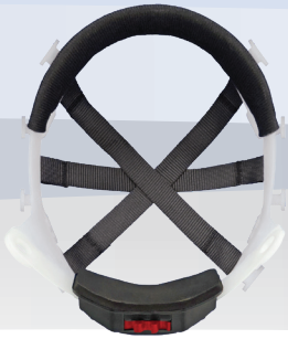
SIX-POINT RATCHET SUSPENSION REPLACEMENT HH-A1